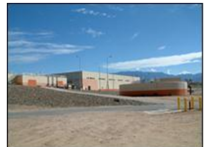
The New Surface-Water Treatment Plant

To reduce reliance on groundwater, the San Juan – Chama Drinking Water Project which replaces groundwater with treated contract surface water and the Reclamation/Reuse Project which uses treated effluent for irrigated sites such as parks and golf